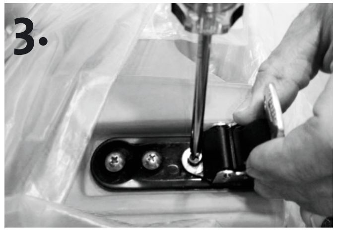
Screw hand tight