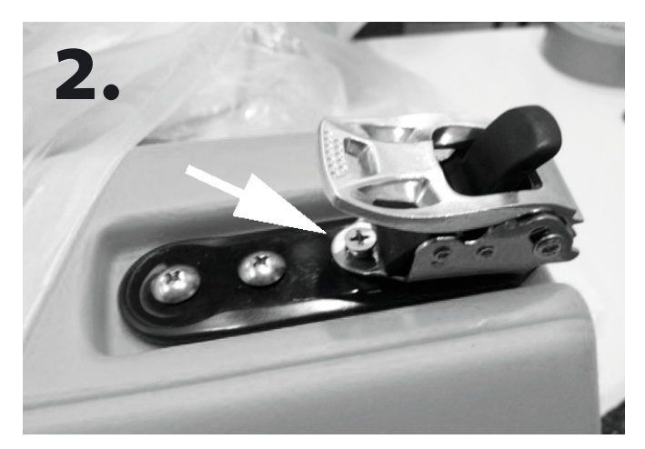
Place the buckle in position as shown